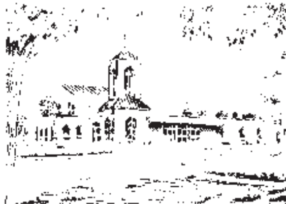
Our Lady of the Lake 129 Metro Road North, Keswick, ON L4P 3C8 Office: 905-476-0097 Fax: 905-476-0897